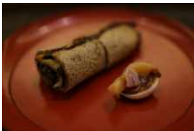
Tango Food (experimental)