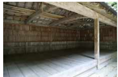
Takano Shrine, Emaden