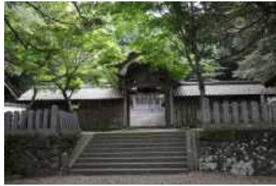
Takano Shrine