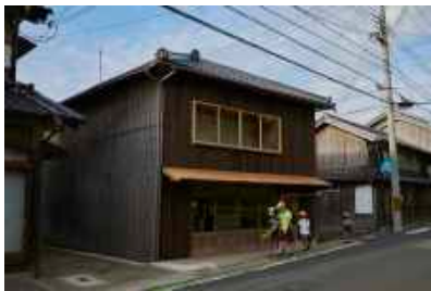
Taiza Studio