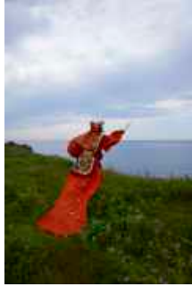
ECHO TOMORROW FIELD - Food and art event