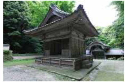
Takano Shrine