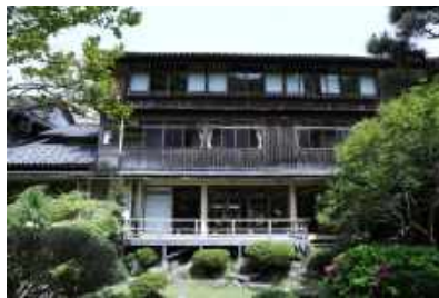
Kinosaki Onsen Mikiya