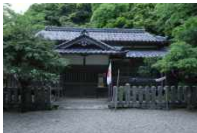
Takano Shrine, shrine office