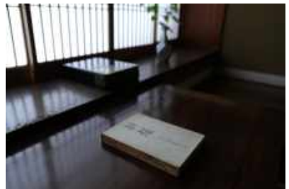
Yoshihiro Suda "Morning Glory" Photo: * Tentative image