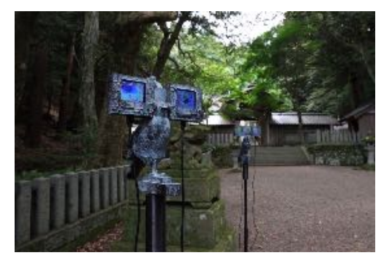
Samson Young "The messengers", 2022

At Takano Shrine, based around the word "pray," Hong Kong-based multi-disciplinary artist Samson Young creates installation works with sculpture, video and drawings. Through the approach to main shrine, Birds, which were symbol as messengers from different worlds in the ancient civilizations of ancient Egypt, Greece and China, welcome