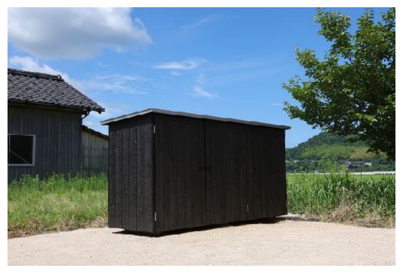
H1.65 × W3.2 × D1.0 m, smoked cedar store house by Office of Ryue Nishizawa

We hope you travel and explore the food and art experience in Kyotango!